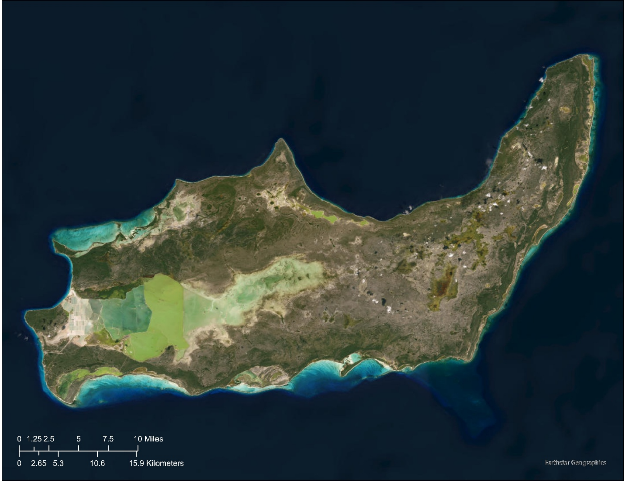
Figure 1: Map of Great Inagua, The Bahamas

Great Inagua also supports important industrial salt production activities operated historically by Morton Salt and its successor ownership groups. The network of roads, ponds, impoundments, and hydrological systems associated with salt production contributes significantly to the physical landscape and ecological dynamics of portions of the island, including habitat conditions important for flamingos and other wetland-dependent species.