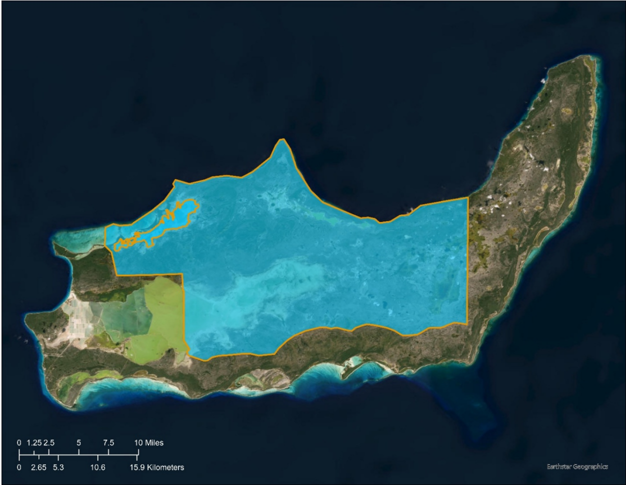
Figure 2: Map of Inagua National Park (INP)

Inagua National Park occupies the northern portion of Great Inagua and encompasses approximately 220,000 acres (approximately 89,000 hectares) of terrestrial, wetland, coastal, and marine environments. The park includes extensive saline lakes, tidal flats, mangrove wetlands, coastal coppice habitats, shallow marine banks, seagrass meadows, coral reef and hardbottom systems. The park also forms the core of The Bahamas' only designated Ramsar Wetland of International Importance.