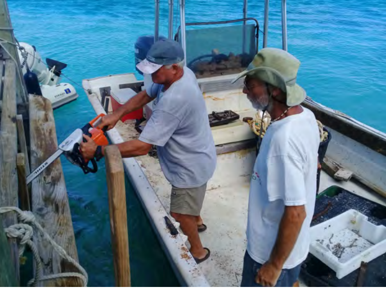
ECLSP volunteers repair the Peggy Hall Dock.