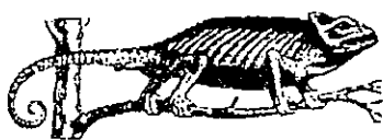
SECOND WORLD CONGRESS OF HERPETOLOGY AUSTRALIA 1993-1994