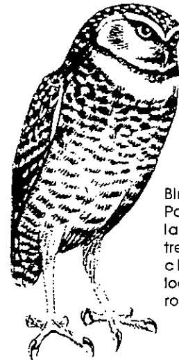
Birders on Paradise Island were treated to a close-up look of a Burrowing Owl!

the activities themselves and the report were among the most outstanding we have received."