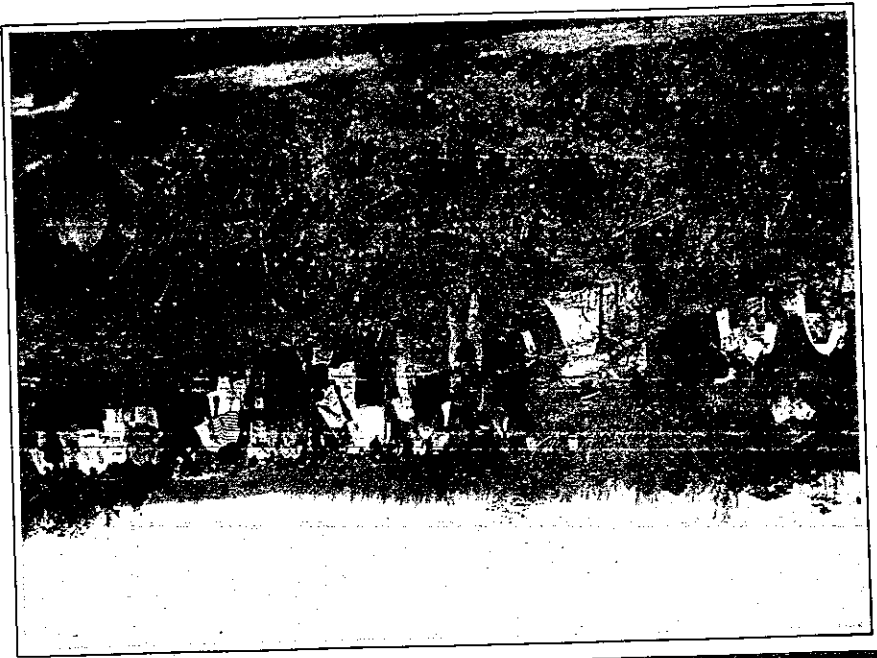
"Back to Nature" guides.